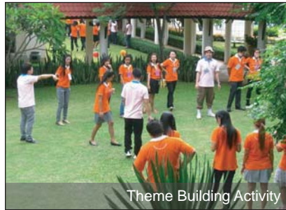
Theme Building Activity