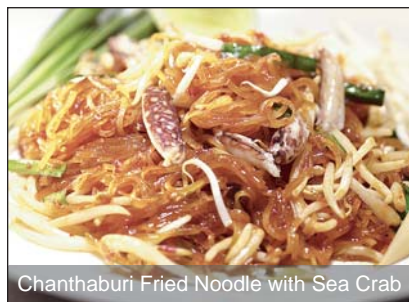
Chanthaburi Fried Noodle with Sea Crab