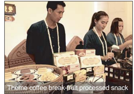
Theme coffee break-fruit processed snack