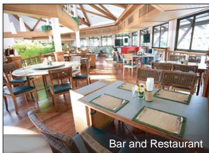
Bar and Restaurant

In addition , given abundance of our garden area, we have been hosting many team building activity and also taking part in CSR activity that guests wish to set up in Chanthaburi.