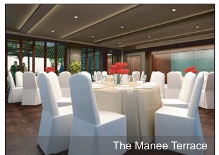
The Manee Terrace