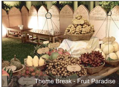
Theme Break - Fruit Paradise

" YOUR PERFECT MEETING VENUE IN THE EAST OF THAILAND, JUST 2.5 HOUR DRIVE FROM BANGKOK "